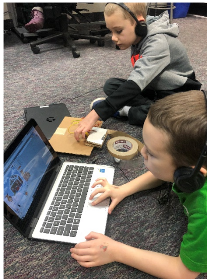
2 nd grade students design and code a counter to track donations during a student-initiated Holiday Food Drive.