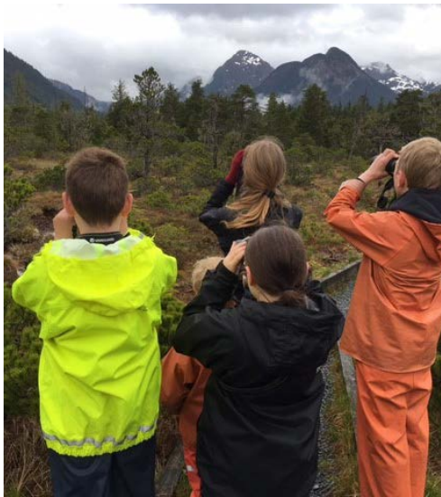
REACH homeschool students work with a local scientist to learn about and study birds that live in our community.