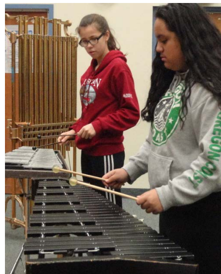
Middle School students practice a duet to be performed. A majority of our middle school students play an instrument.