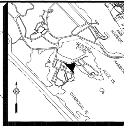
VICINITY MAP SCALE 1"=1,000'

THIS SURVEY UTILIZED AN IDENTICAL SCALE FACTOR AND DELTA GAMMA ANGLE ROTATION. THIS ALLOWED THE SURVEY TO REMAIN CONSISTENT WITH THE SITKA AIRPORT BOUNDARY SURVEY AND ALSO WITH A SURVEY CONDUCTED BY R & M CONSULTANTS, INC. FOR THE US BUREAU OF INDIAN AFFAIRS IN 1980, TITLED "A SUBDIVISION OF JAPANESE ISLAND (US SURVEY NO. 14963) CHARCOAL ISLAND AND ALICE ISLAND (LOT 96, US SURVEY NO. 3906)". THIS SUBDIVISION PLAT WAS NOT RECORDED BUT WAS UTILIZED BY OTHERS TO CREATE LEGAL DESCRIPTIONS FOR ACCESS AND UTILITY EASEMENTS AND THE TREATMENT PLANT EXCLUSION AREA ON CHARCOAL ISLAND.