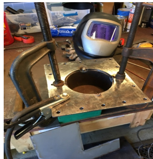
Custom in-house fabricating