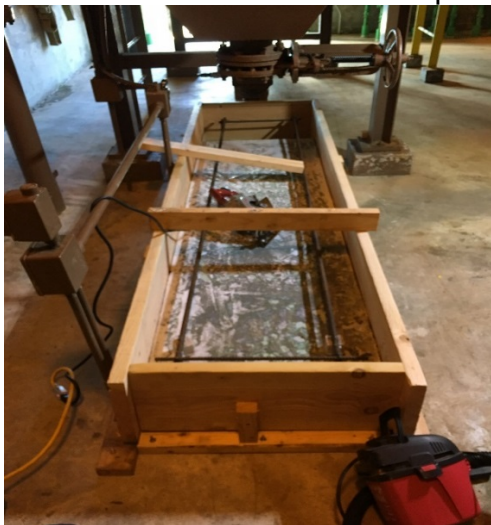
Forms for new concrete pad