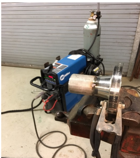
Welding New Discharge