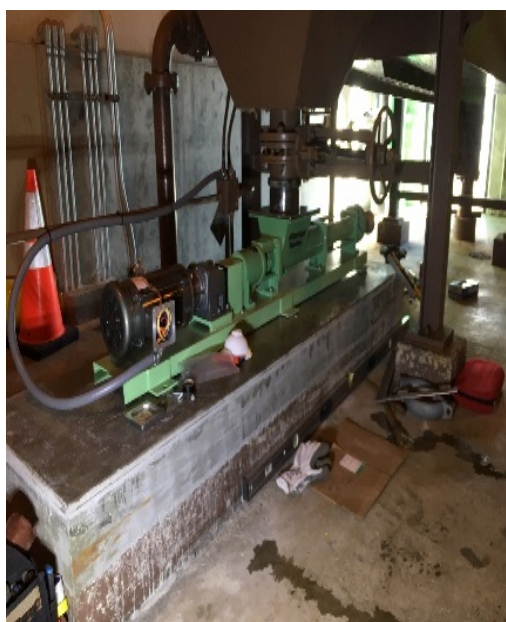
New pad & pump install in-process