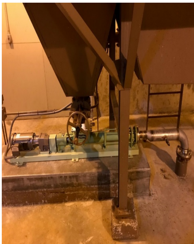
Project Complete – job well-done by the Wastewater Division