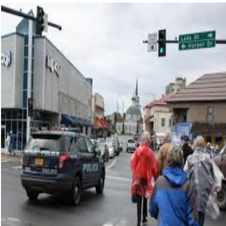
Even Sitka's damp weather can't stop our visitors from enjoying our town.