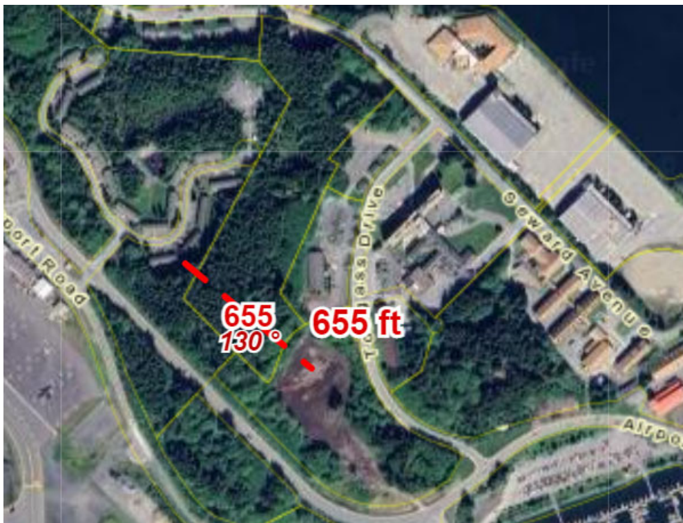
Distance to closest USCG housing structure ~655 feet