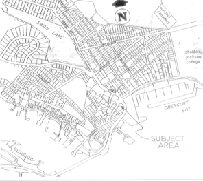
VICINITY MAP SCALE: 1" = 1000'