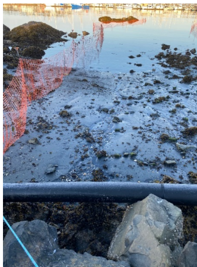
Safety fencing blocking the area