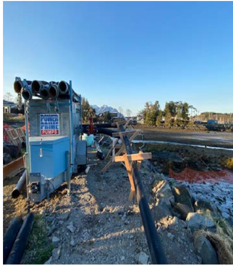
Bypass pump with piping