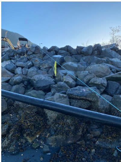
The leak is surfacing under the rip rap near the caution tape

The estimated maximum cost of the leak repair is $80,000 and includes labor, materials, design and project management. Making the repair during the Brady Lift Station project versus doing it now is anticipated to save the CBS money, but repairs may be needed sooner based on inefficiencies and risks associated with bypass pumping. Public Works has included this additional cost in the budget in the event bypass pumping becomes unsustainable and the repair cannot be delayed.