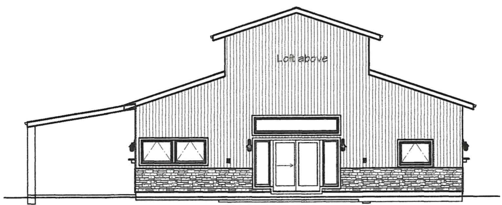
Exterior Elevation Back