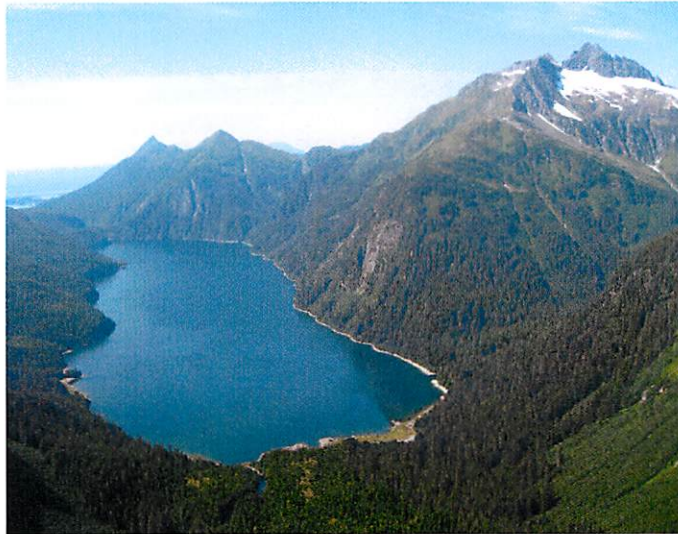
Blue Lake Reservoir – Sitka, Alaska

The City and Borough of Sitka, Alaska (CBS) is requesting proposals and/or bids from companies or individuals wishing to purchase high quality fresh, raw water for bulk export. The annual amount of water available for bulk export is 23,938 acre feet (7,800,257,957 gallons). The source of the water is the Blue Lake Reservoir, a body of water fed by mountain spring, snowmelt and rain precipitation. Blue Lake water is nearly pure in its natural state, and Sitka is not required to filter the water prior to purification and distribution to the consumer. The water that we sell for bulk water export is in its raw, untreated state. A complete chemical analysis of the water is available upon request. In addition, 2,228 acre feet (725,996,028 gallons) of water has been set aside for potential bottled water businesses.