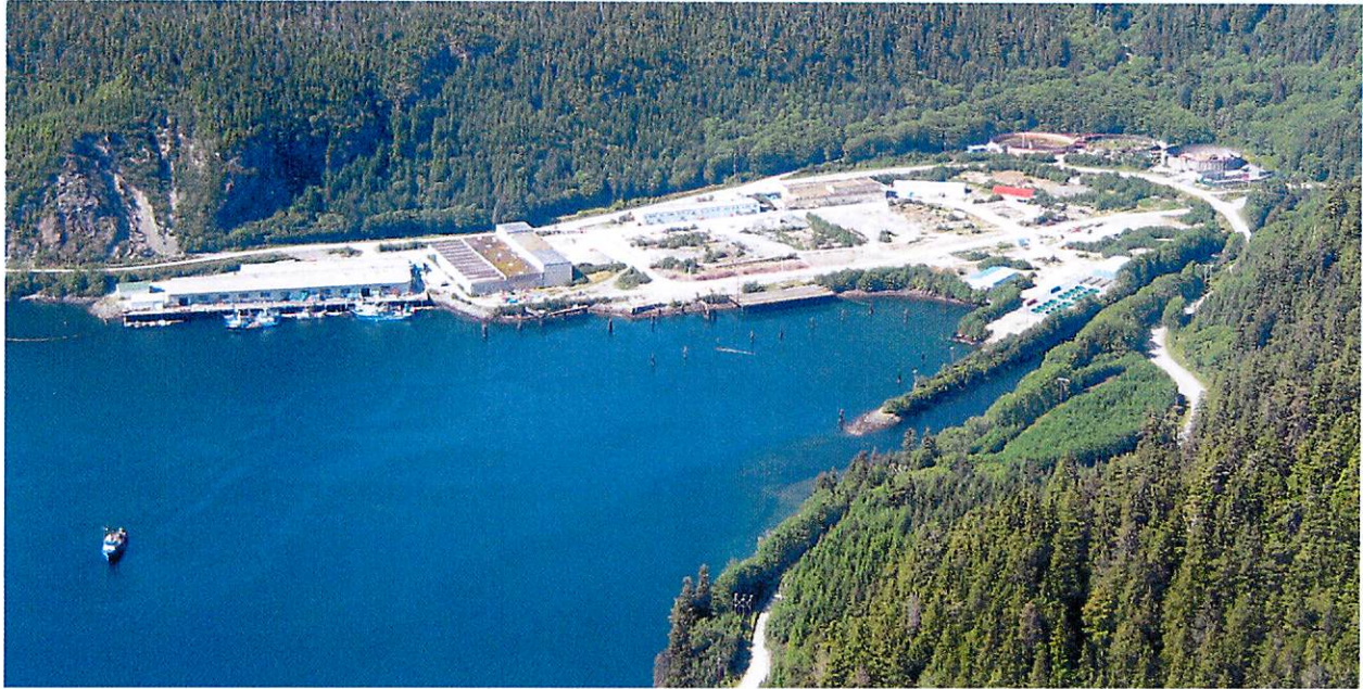
Gary Paxton Industrial Park - 2010

Since taking ownership of the property, the CBS has received nearly $10 million in federal grant money to replace the original water, sewer and electrical systems in the Park. In 2014, the Blue Lake dam was raised an additional 83' increasing hydro-electric capacity to an annual average of 98,000 Megawatt hours.