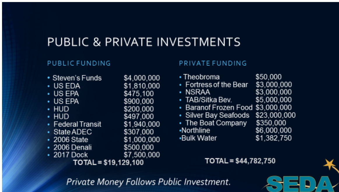
Figure 1 – GPIIP investments over time