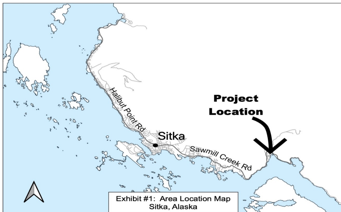
Figure 2 – Gary Paxton Industrial Park Location map

See GPIP Map1.pdf and GPIP Map2.pdf for site location courtesy of the City and Borough of Sitka.