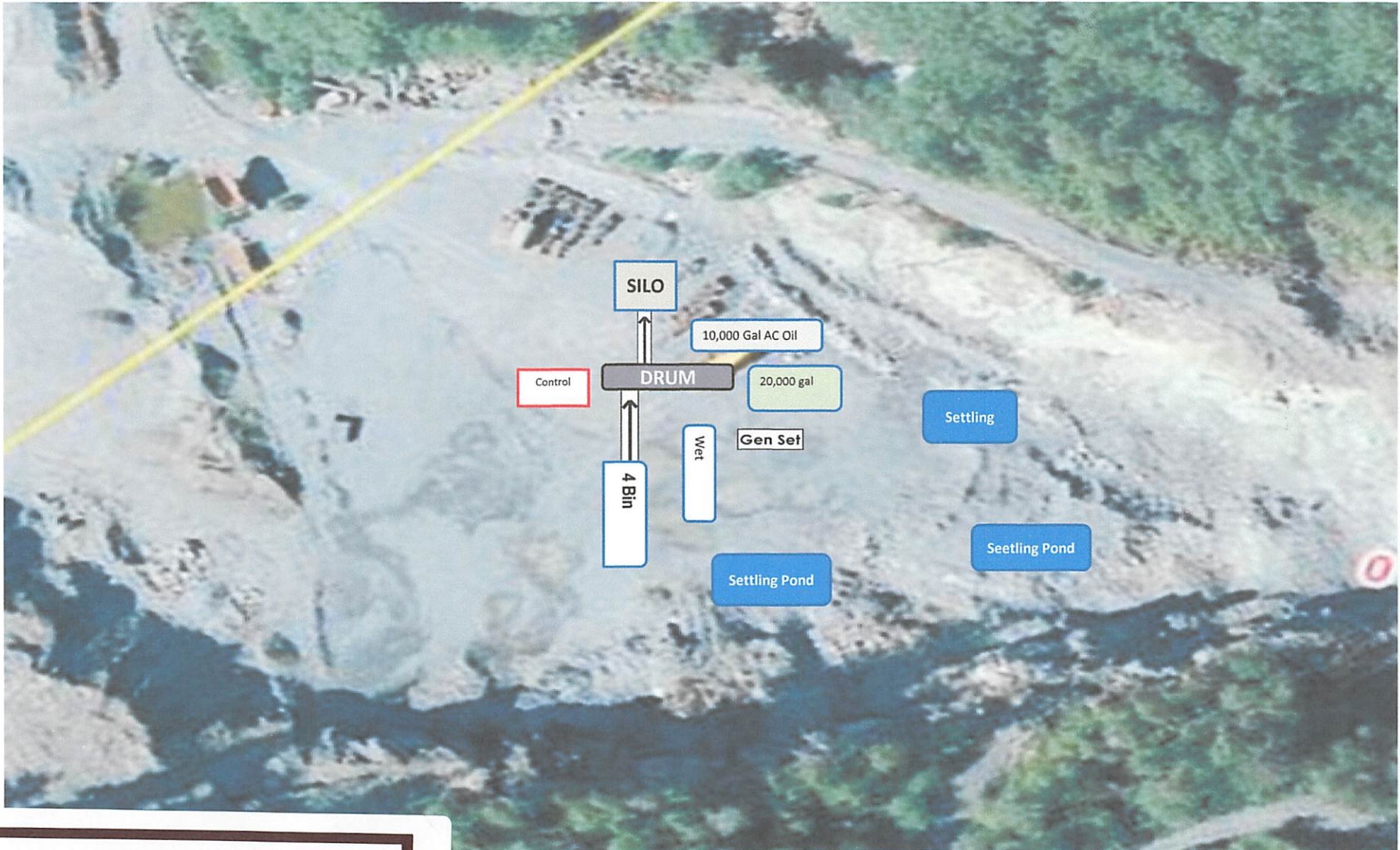
S & S General Contractors Asphalt Plant Temporary Permit Granite Creek Quarry Area Lease Lot 5