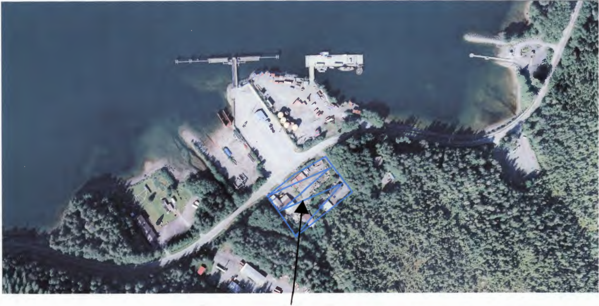
Allen Conditional Use Permit Request 5304 Halibut Point Road