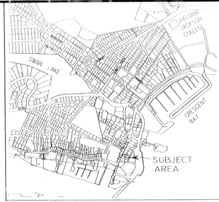
VICINITY MAP SCALE: 1" = 1,000'