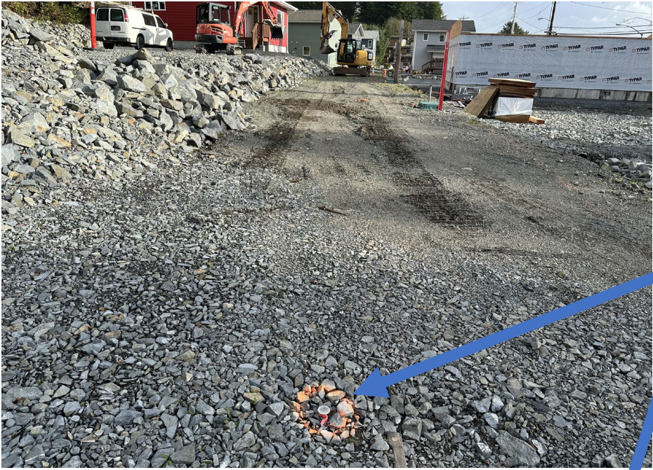
Pedestrian/ Access and Utility Easement