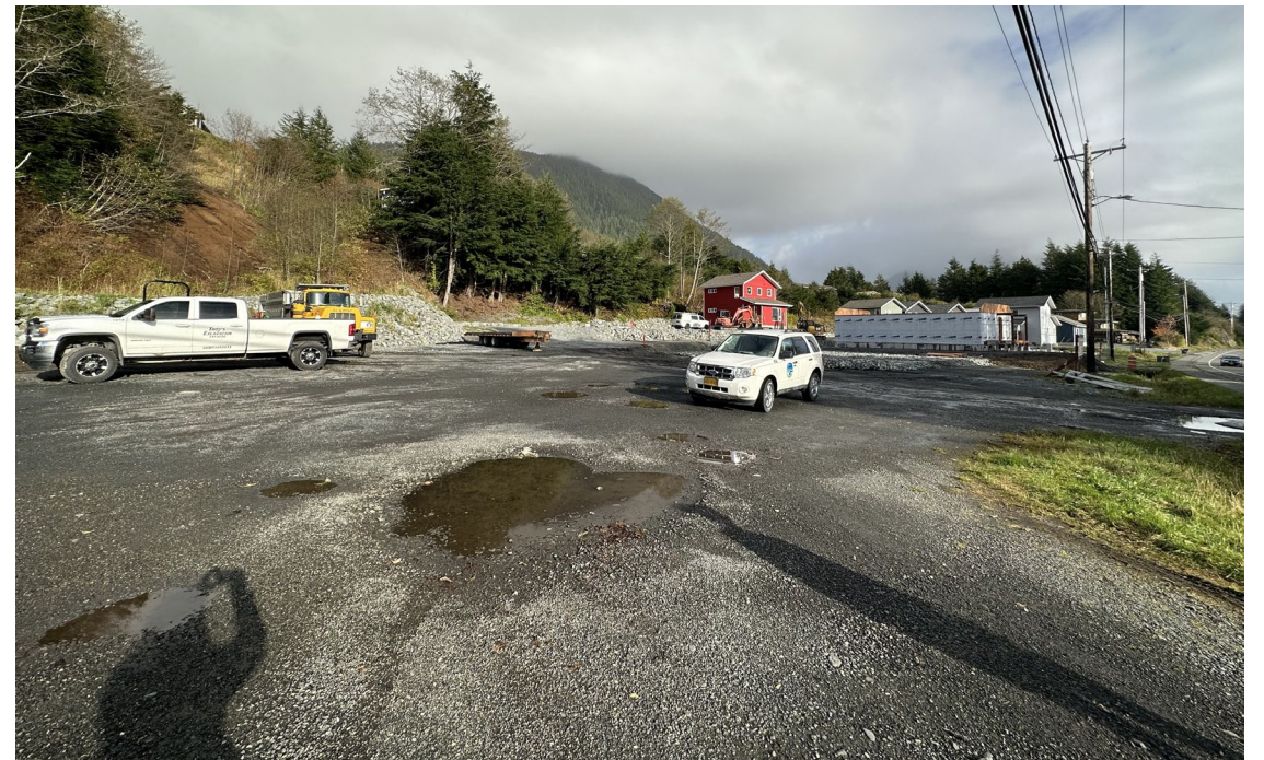
Lot 10 (1414 HPR) and Lot 8 Unsubdivided Remainder (1410 HPR)