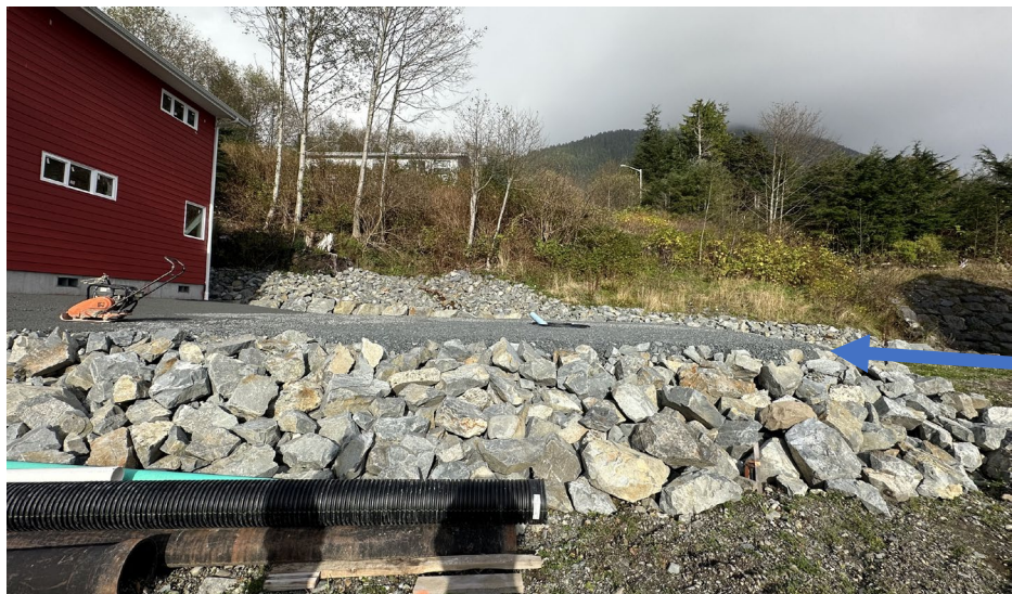
Lot 8 new Community lot site