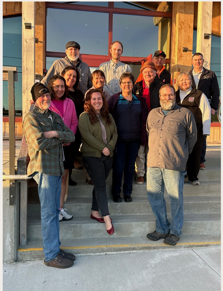
STA/CBS Government to Government Dinner, April 30, 2024