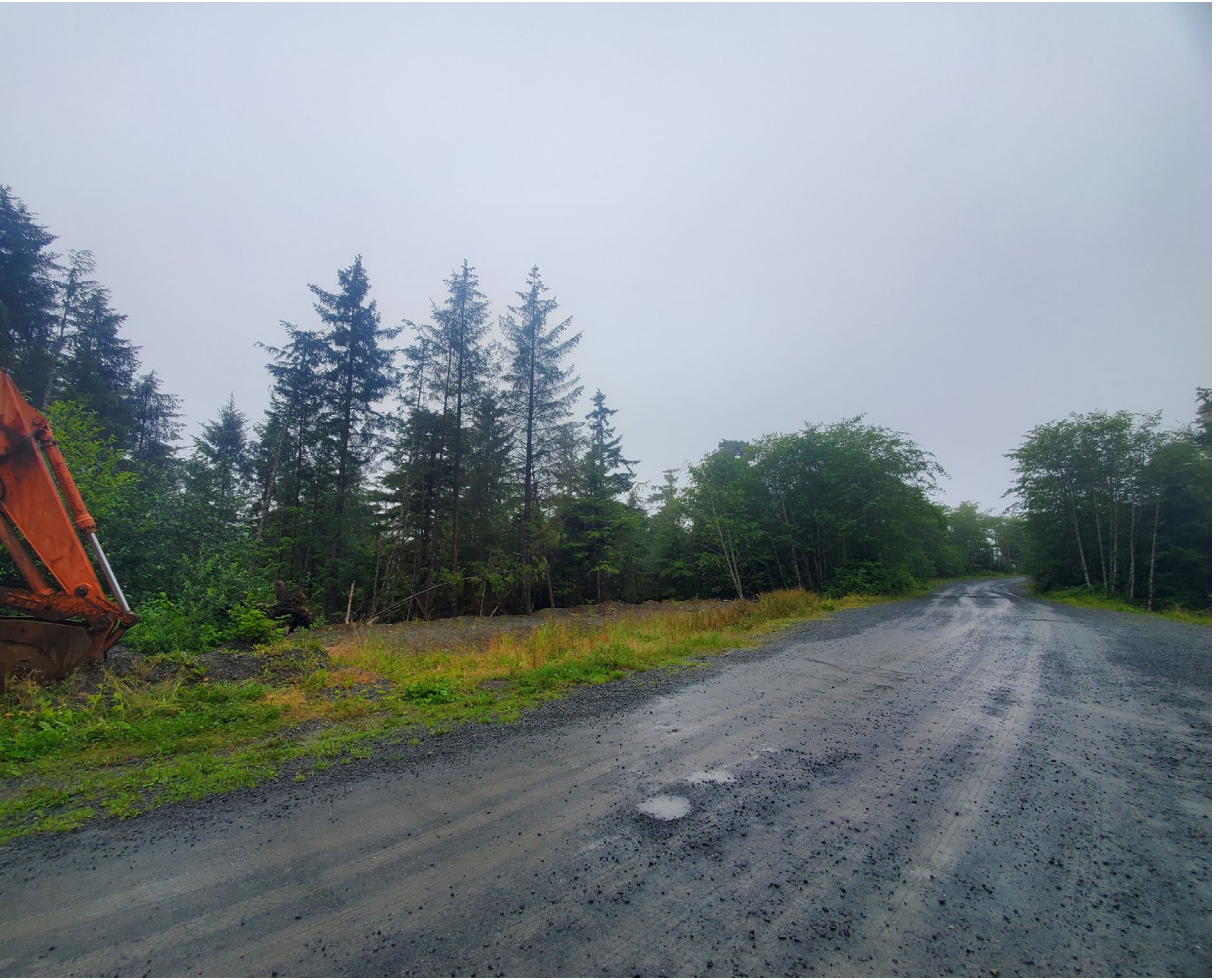
Typ. vegetation and density of lot interior